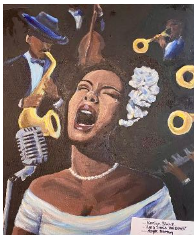
Lady Sings the Blues Acrylic painting