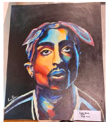
Tupac Acrylic Paint