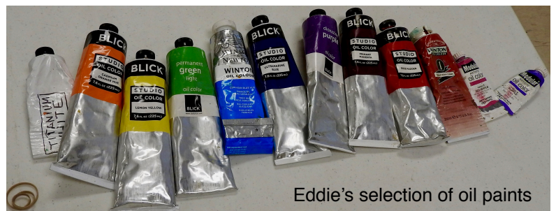
Eddie's selection of oil paints