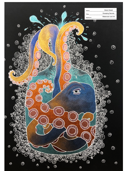
Escaping Secrets, Watercolor & Ink