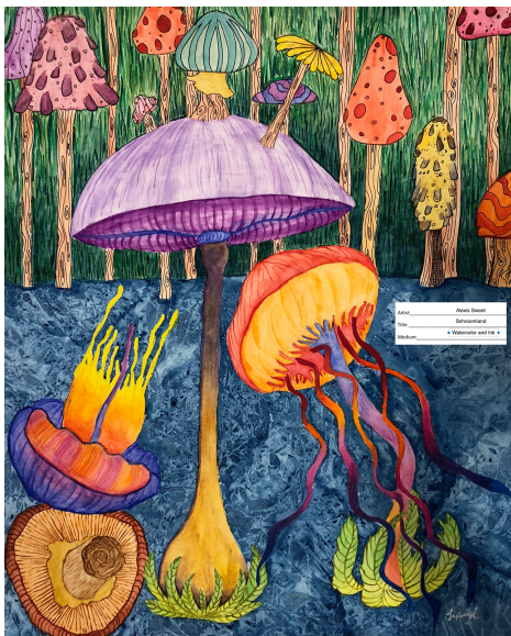
Schroomland, Watercolor & Ink